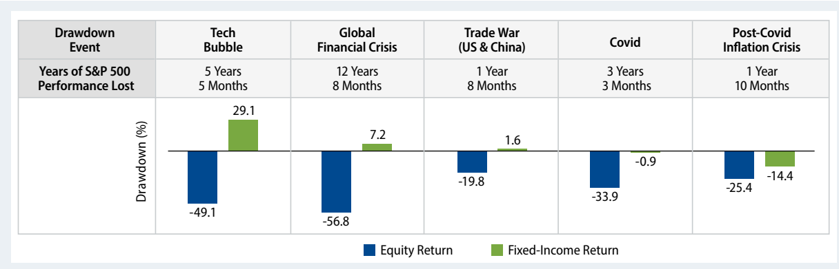
Exhibit 4: Fixed-Income Allocation Helps Avoid Portfolio Wipeouts in Volatile Markets

Source: Bloomberg. S&P 500 Index, US Aggregate Index. As of 31 Aug 23.