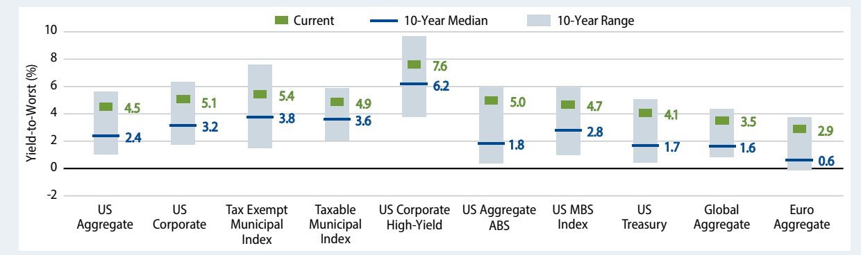
Exhibit 1: The Return of Appealing Returns—Fixed-Income Yields by Sector

Bond valuations are attractive—with investment-grade credit currently yielding upwards of 5%, investors can beat cash rates and don't need to reach for yield in riskier sectors any longer. In fact, today's bond yields are also as attractive as they've been since the global financial crisis, according to Bloomberg. But one benefit in the aftermath of the recent rough patch is that yields and valuations have been restored—offering new opportunities for carry.